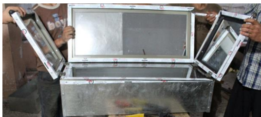
Figure 3. The addition of the mirrors