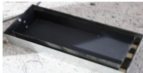
Figure 1. Galvanized steel boxes separated by wooden pieces

In (3.3), M_s refers to the mass flow rate of water at inlet which is assumed to be fully converted to steam at outlet, C_p denotes the specific heat of water, \Delta T refers to the temperature difference, and L is the latent heat of steam vaporization. M_s is determined by balancing the heat supplied to heat absorbed ( Q_a = Q_s ), and setting the respective values of C_p = 4.178\text{kJ/kgK} , L = 2257\text{kJ/kg} and \Delta T in (3.3). For example if steam is produced at atmospheric pressure from water at 25^\circ\text{C} \Delta T = 100 - 25 = 75 , M_s works out to be 0.316\text{kg/hr} . The system results have been compared with local available heating systems using traditional source of energy and it proves to be more efficient by almost 25% and will not contribute to the electricity bill. The only cost will be the material used in the construction. The most important outcome is the mobility of the system and that it can serve small houses instead of large solar system that is common in water heating.